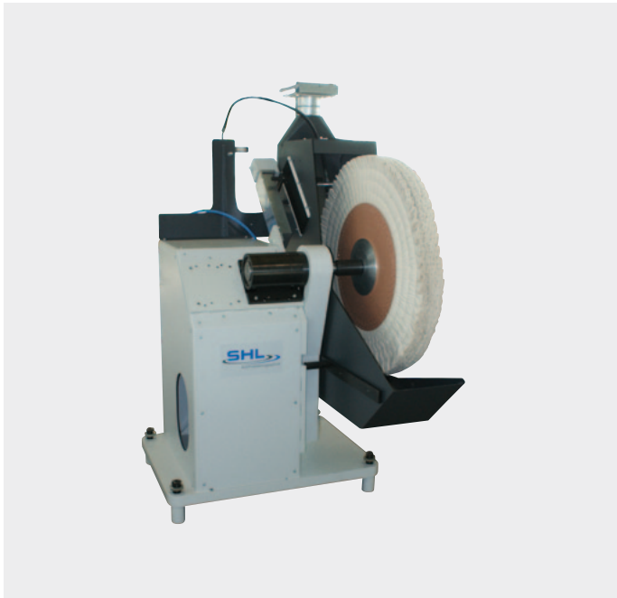
EP 1000 ROB