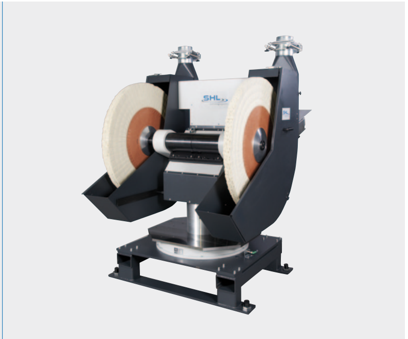
DP 1000 ROB with DPE-G